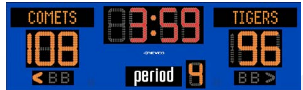
OPTIONAL ELECTRONIC TEAM NAMES AVAILABLE