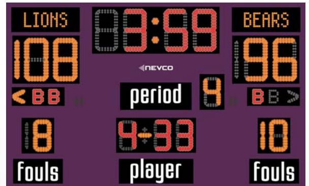
OPTIONAL ELECTRONIC TEAM NAMES AVAILABLE