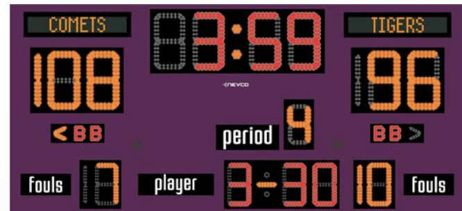
OPTIONAL ELECTRONIC TEAM NAMES AVAILABLE