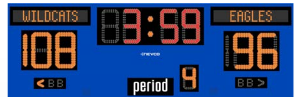
OPTIONAL ELECTRONIC TEAM NAMES AVAILABLE