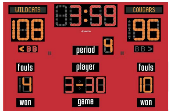
OPTIONAL ELECTRONIC TEAM NAMES AVAILABLE