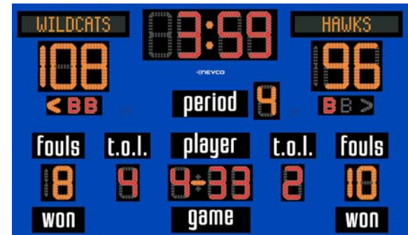
OPTIONAL ELECTRONIC TEAM NAMES AVAILABLE