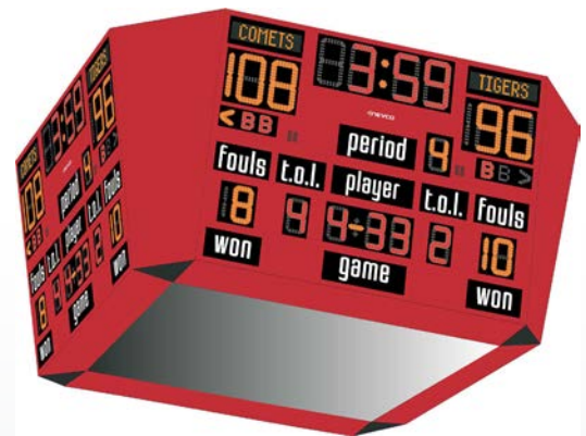
OPTIONAL ELECTRONIC TEAM NAMES AVAILABLE