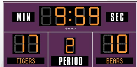
SHOWN WITH OPTIONAL ELECTRONIC TEAM NAMES