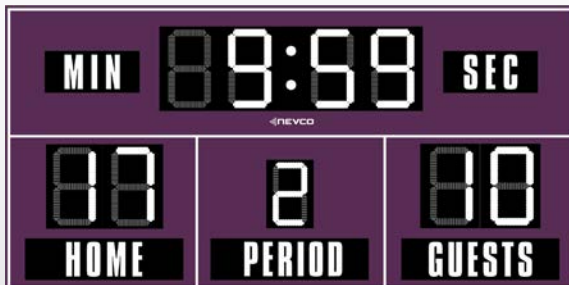
SHOWN WITH OPTIONAL WHITE LEDS