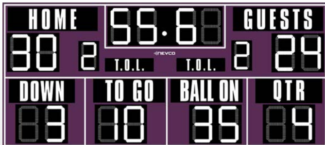
SHOWN WITH OPTIONAL WHITE LEDS