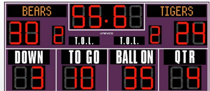
SHOWN WITH OPTIONAL ELECTRONIC TEAM NAMES

Advanced timing features ideal for combination Football, Baseball, Soccer, Lacrosse and Field Hockey facilities.