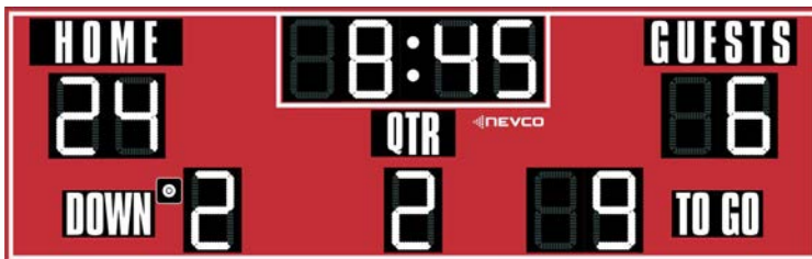
SHOWN WITH OPTIONAL WHITE LEDS