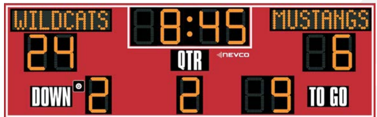
SHOWN WITH OPTIONAL ELECTRONIC TEAM NAMES