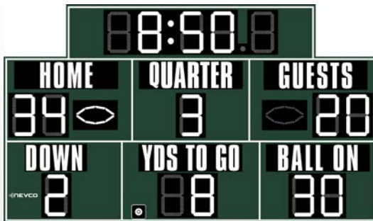
SHOWN WITH OPTIONAL WHITE LEDES