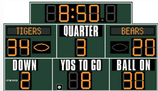
SHOWN WITH OPTIONAL ELECTRONIC TEAM NAMES

Advanced timing features ideal for combination Football, Baseball, Softball, Soccer, Lacrosse, Field Hockey and Track facilities.