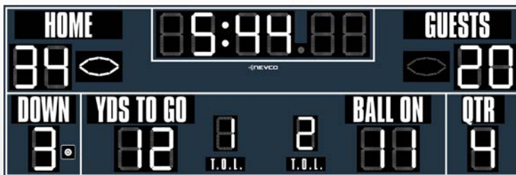
SHOWN WITH OPTIONAL WHITE LEDS