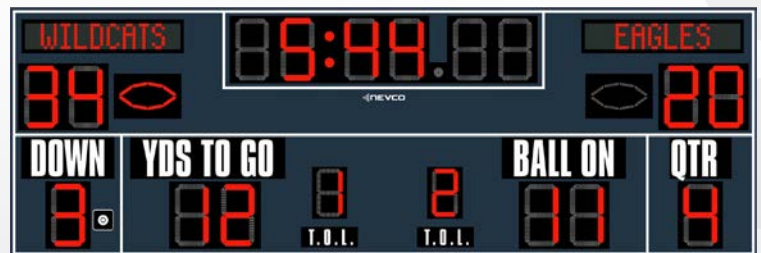
SHOWN WITH OPTIONAL ELECTRONIC TEAM NAMES

Advanced timing features ideal for combination Football, Baseball, Softball, Soccer, Lacrosse, Field Hockey and Track facilities.