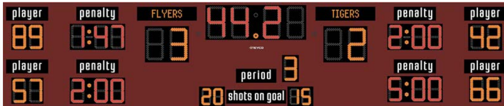
OPTIONAL ELECTRONIC TEAM NAMES AVAILABLE