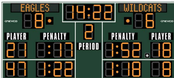
SHOWN WITH OPTIONAL ELECTRONIC TEAM NAMES