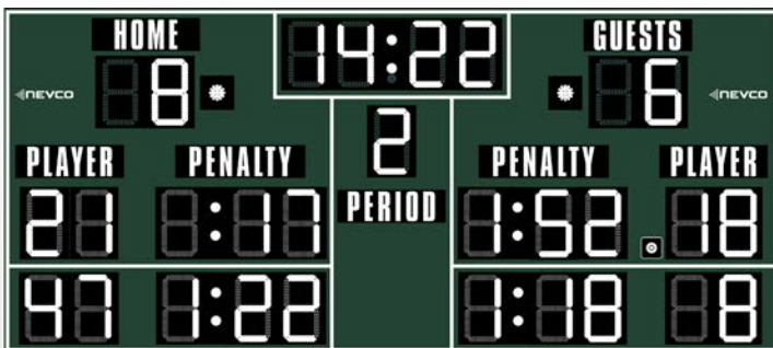
SHOWN WITH OPTIONAL WHITE LEDS