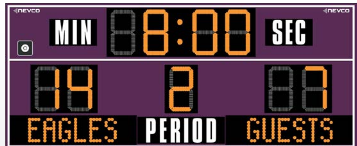
SHOWN WITH OPTIONAL ELECTRONIC TEAM NAMES