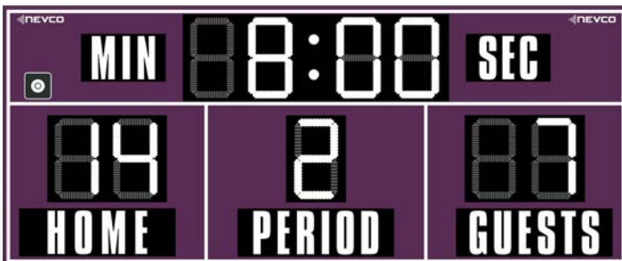
SHOWN WITH OPTIONAL WHITE LEDES