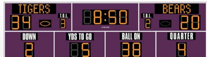
SHOWN WITH OPTIONAL ELECTRONIC TEAM NAMES