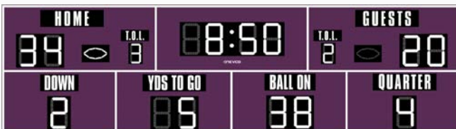
SHOWN WITH OPTIONAL WHITE LEADS