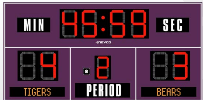
SHOWN WITH OPTIONAL ELECTRONIC TEAM NAMES