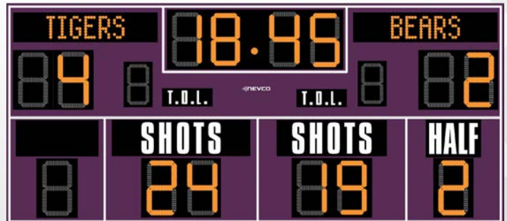
SHOWN WITH OPTIONAL ELECTRONIC TEAM NAMES