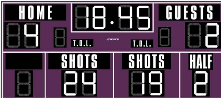
SHOWN WITH OPTIONAL WHITE LEDES