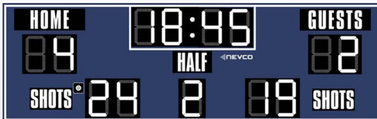
SHOWN WITH OPTIONAL WHITE LEDS