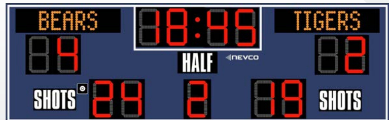
SHOWN WITH OPTIONAL ELECTRONIC TEAM NAMES