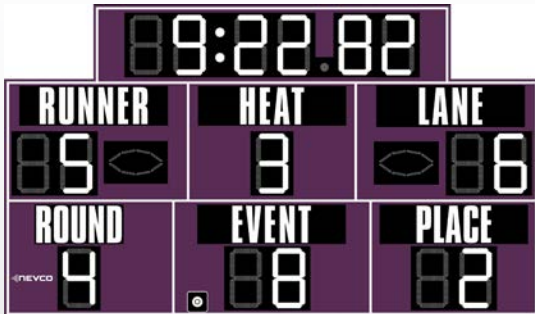
SHOWN WITH OPTIONAL WHITE LEDS