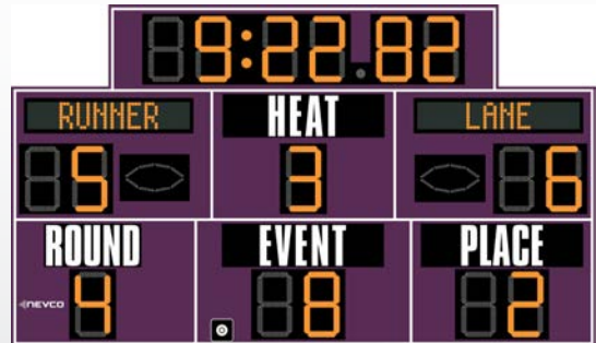
SHOWN WITH OPTIONAL ELECTRONIC TEAM NAMES

Advanced timing features ideal for combination Track, Football, Baseball, Softball, Soccer, Lacrosse and Field Hockey facilities.