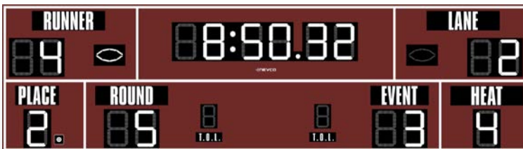
SHOWN WITH OPTIONAL WHITE LEDS