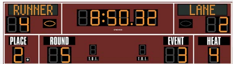
SHOWN WITH OPTIONAL ELECTRONIC TEAM NAMES