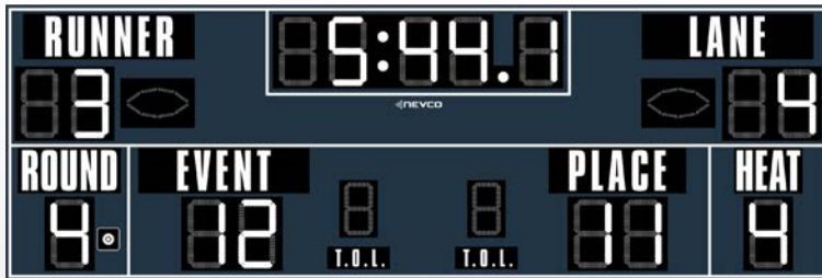
SHOWN WITH OPTIONAL WHITE LEDS