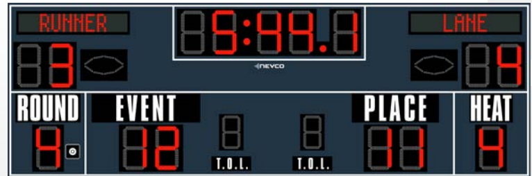
SHOWN WITH OPTIONAL ELECTRONIC TEAM NAMES