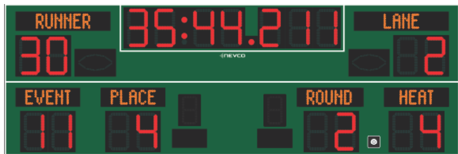
*Shown with Finish Lynx Interface

Advanced timing features ideal for combination Track, Football, Baseball, Softball, Soccer, Lacrosse and Field Hockey facilities.