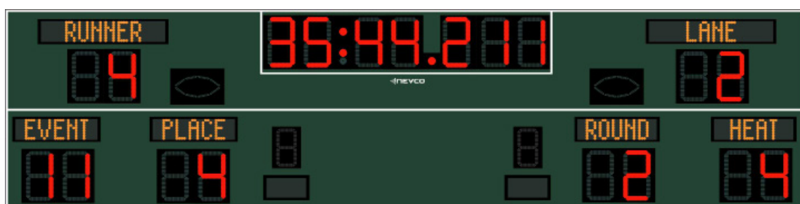
Shown with Finishlynx® Interface

Advanced timing features ideal for combination Track, Football, Soccer, Lacrosse, Field Hockey, Baseball, Softball, and facilities.