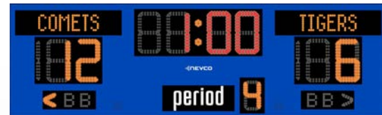
OPTIONAL ELECTRONIC TEAM NAMES AVAILABLE