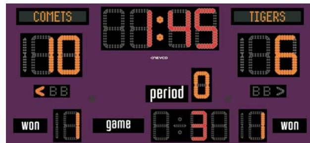
OPTIONAL ELECTRONIC TEAM NAMES AVAILABLE