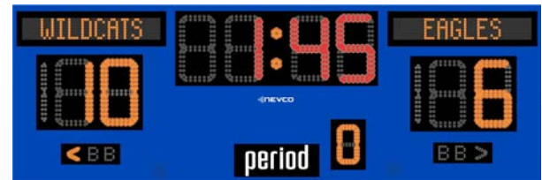
OPTIONAL ELECTRONIC TEAM NAMES AVAILABLE