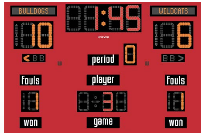
OPTIONAL ELECTRONIC TEAM NAMES AVAILABLE