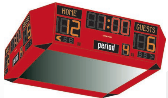
OPTIONAL ELECTRONIC TEAM NAMES AVAILABLE