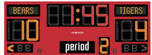
OPTIONAL ELECTRONIC TEAM NAMES AVAILABLE