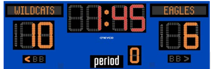
OPTIONAL ELECTRONIC TEAM NAMES AVAILABLE