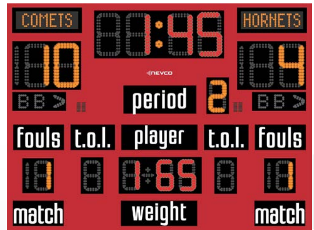
OPTIONAL ELECTRONIC TEAM NAMES AVAILABLE