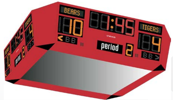
OPTIONAL ELECTRONIC TEAM NAMES AVAILABLE