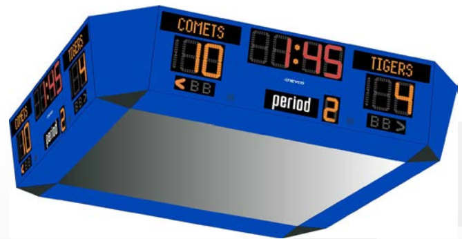
OPTIONAL ELECTRONIC TEAM NAMES AVAILABLE